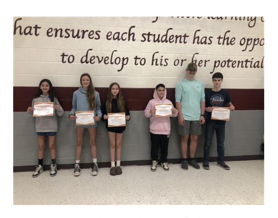
National Junior Honor Society