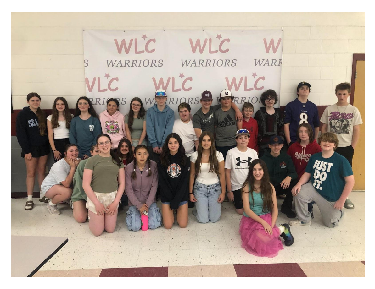
We celebrated our National Junior Honor Society members and inductees at their induction ceremony. We inducted 15 new members into our WLC chapter.