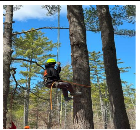
N.H. Forest Career Field Day

N.H. Forest Career Field Day was created to educate students in grades 7-12 about the various careers available in forestry, wildlife, and natural resources, conservation and the forest products industry. On April 17th WLC took XX students to this event; to experience through hands-on demonstrations and exhibits provided by individuals and companies from the fields of wood technology, logging, forest and wildlife management, conservation and law enforcement, forest engineering, technology, and sawmill operations, students were able to gain a greater understanding of the opportunities that may be available to them.